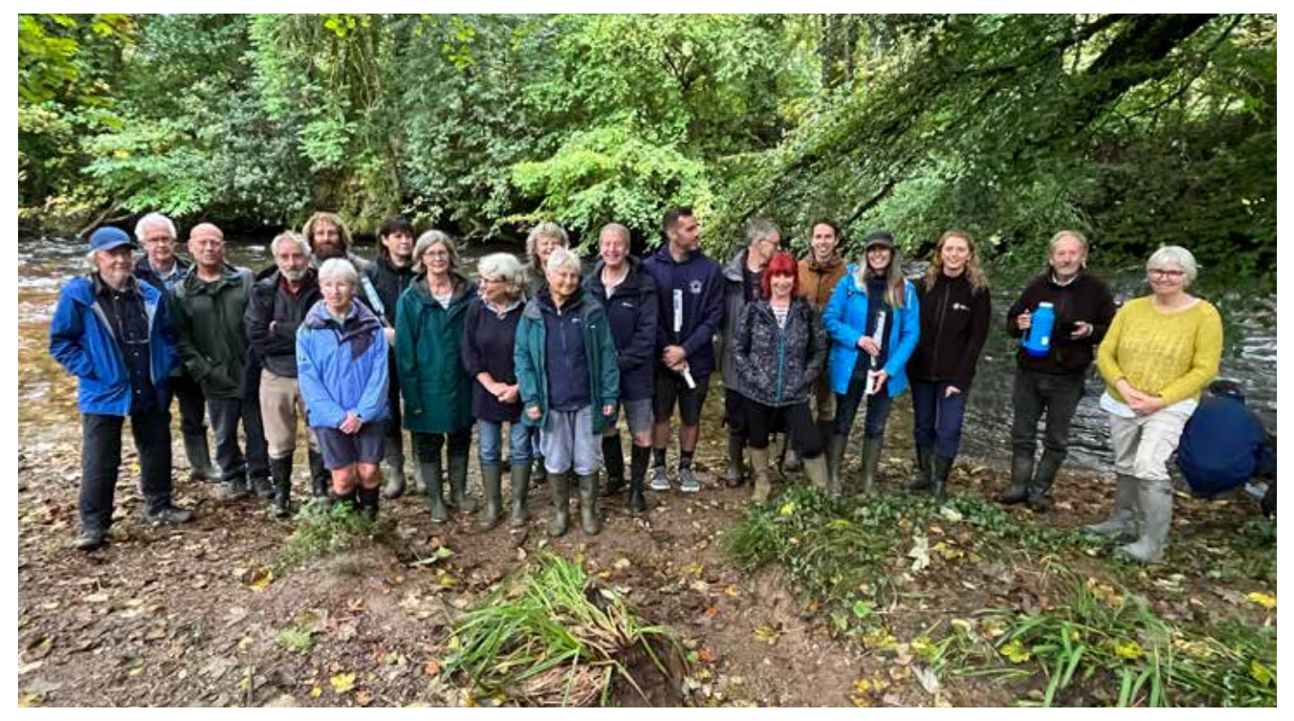
Citizen Science Investigator training by Westcountry Rivers Trust - River Avon